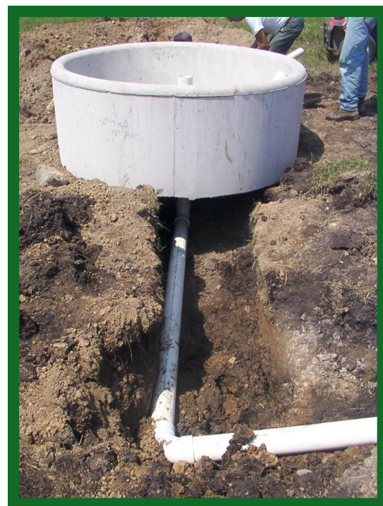
Bury permanent piping underground.

Permanent or frequently used watering facilities should be protected from erosion and degradation. Refer to Conservation Practice PA561- Heavy Use Area Protection, or talk to your local NRCS office, for more information.