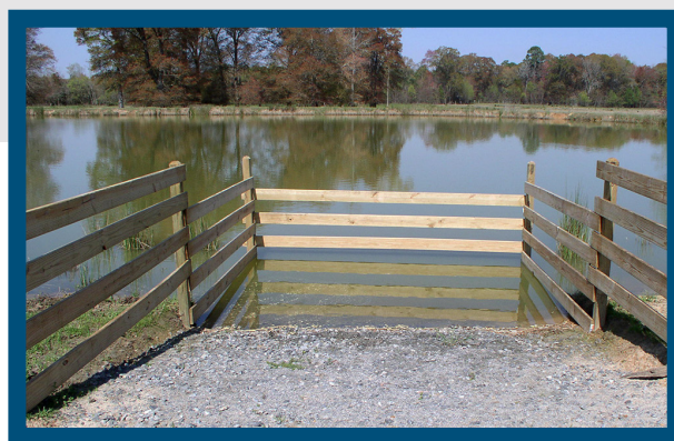
Using a farm pond as a water source