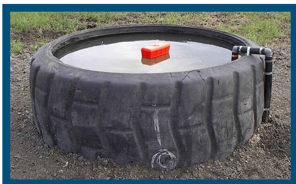
Heavy equipment tire waterer

Livestock watering facilities are permanent or temporary systems that ensure livestock have regular access for their daily requirements of clean water.