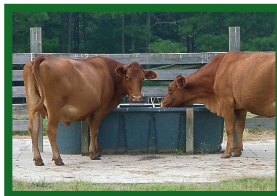
Protected permanent watering trough