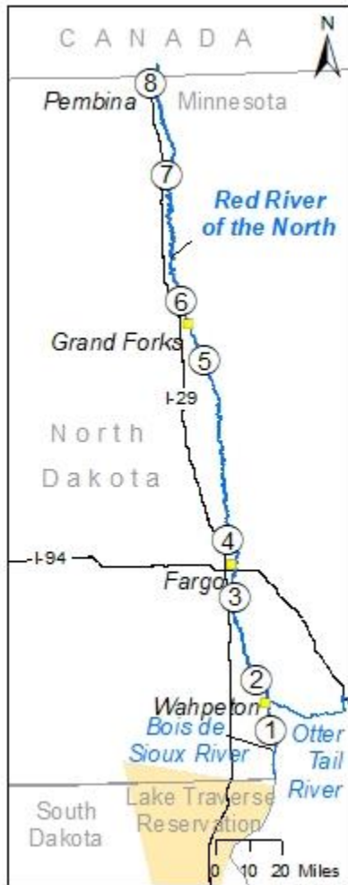
Figure 1. NDDEQ PFAS sampling locations on the Bois de Sioux and Red rivers. Site locations numbered 1-8.

In June and July of 2022, the North Dakota Department of Environmental Quality's (NDDEQ) Watershed Management Program supported a citizen science project addressing emerging contaminants in North Dakota surface water. The project, which focused on PFAS (Per- and Polyfluoroalkyl Substances), partnered with resident Madison Eklund during a kayaking expedition to Hudson Bay. Eklund collected ten water quality samples for PFAS analysis from the Bois de Sioux and Red rivers in eastern North Dakota (Figure 1).