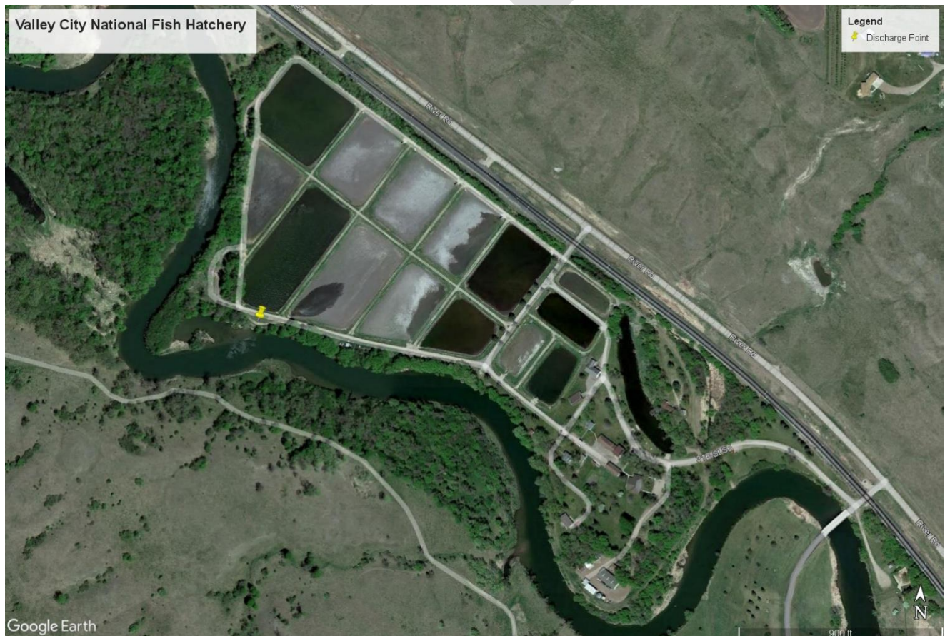
Figure 1. Aerial photograph of Valley City National Fish Hatchery and discharge location – Valley City, ND