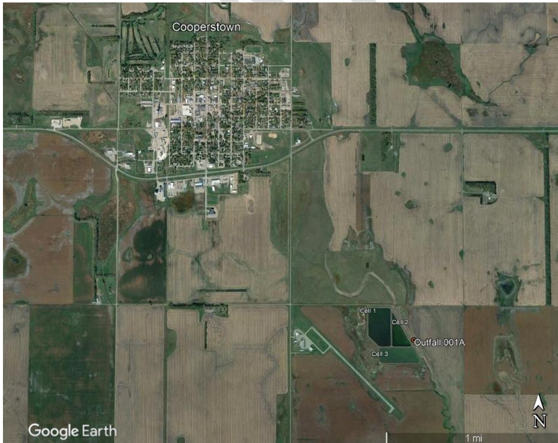
Figure 1: Aerial Photograph of Cooperstown, ND (Google Earth – 2019).