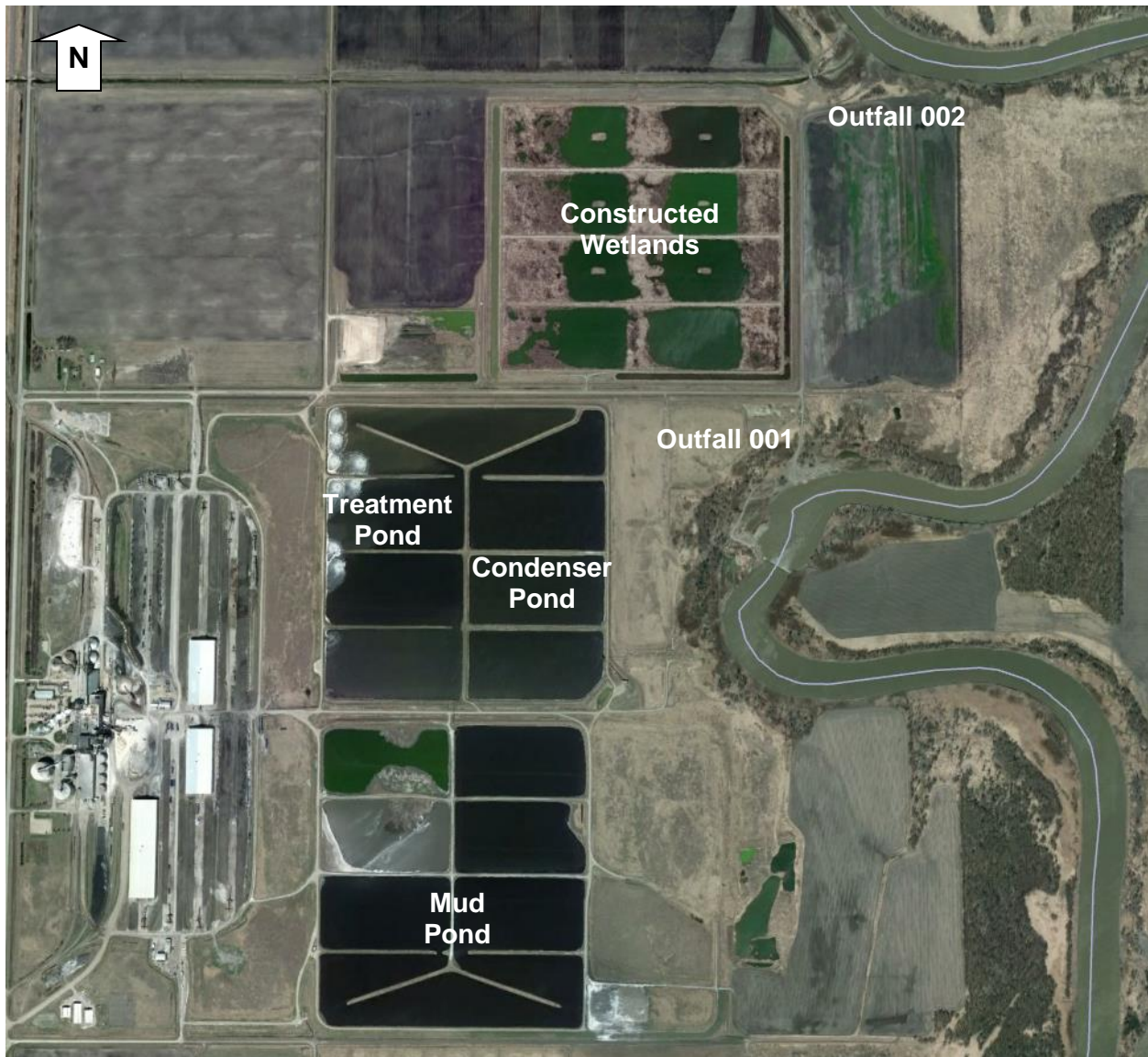
Figure 1 – Aerial Photograph of American Crystal Sugar Company – Drayton Factory